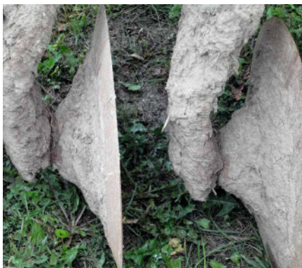
Typical picture of a compact disc harrow covered in dirt following the use of liquid manure.