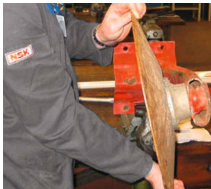
An NSK employee removing the unit from the machine arm.